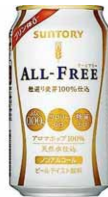
Suntory - Patentee/Plaintiff