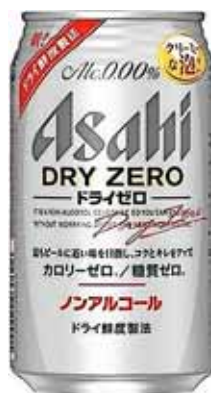
Asahi - Accused Infringer

reject the claim, arguing that the ’754 Patent was invalid as its non-alcoholic, beer-flavored beverage was “obvious” and could be “easily made” from existing technology. It waits to be seen how Asahi’s invalidity defense will fair in this ongoing battle of the breweries.